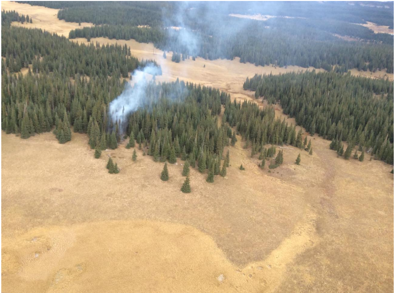
Photo Caption: Photo taken from a reconnaissance flight on the afternoon of Sept. 19 when the Indian Pass Fire was first reported.

Phone: Eagle-Holy Cross Ranger District 970-827-5715