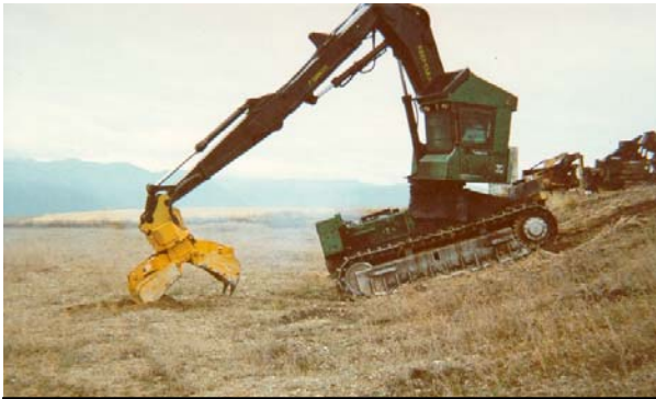
Clam Bucket on Self-Leveling Feller Buncher