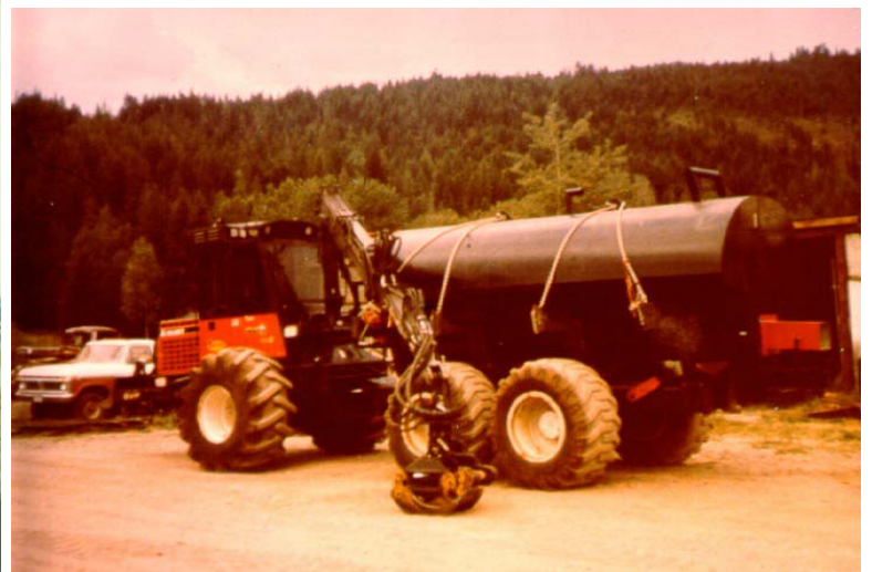
Forwader with tank