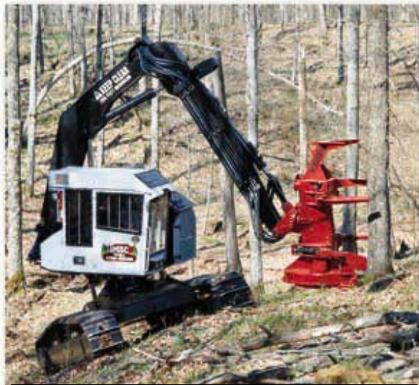
Self-Leveling Feller Buncher with Hot Saw