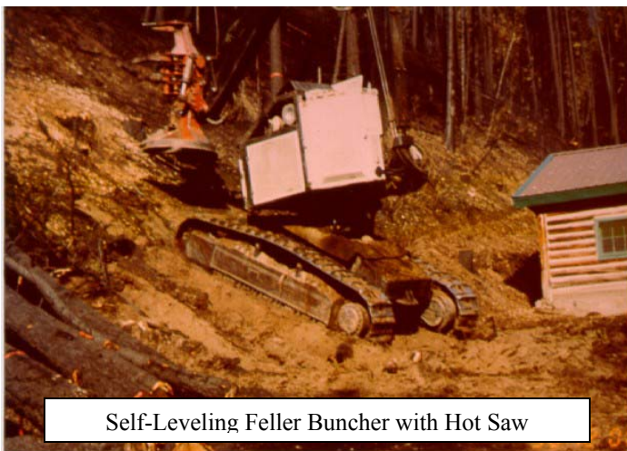
Self-Leveling Feller Buncher with Hot Saw