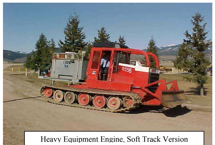
Heavy Equipment Engine, Soft Track Version