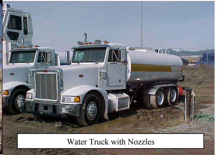
Water Truck with Nozzles