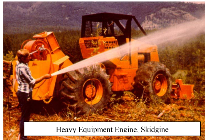
Heavy Equipment Engine, Skidgine