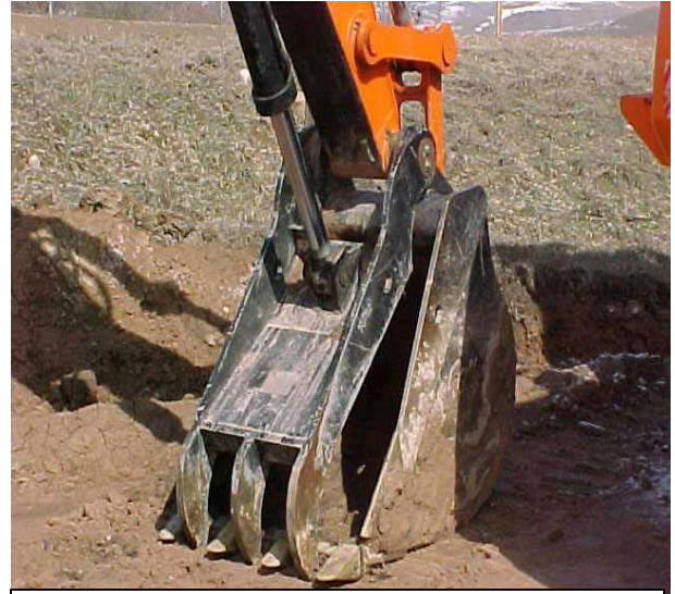
Bucket with thumb