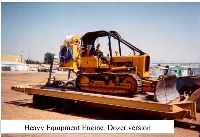
Heavy Equipment Engine, Dozer version