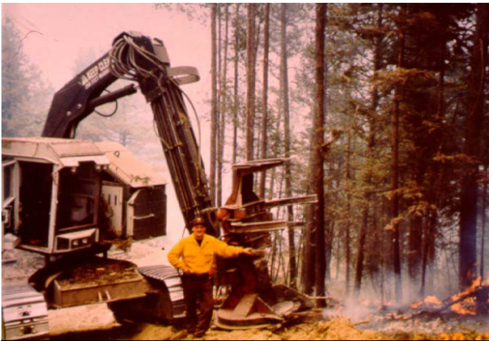
Self-Leveling Feller Buncher with Hot Saw Falling Snags