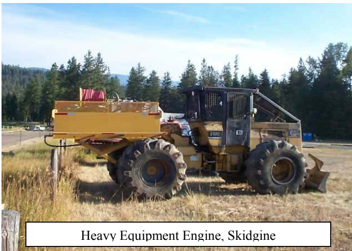
Heavy Equipment Engine, Skidgine