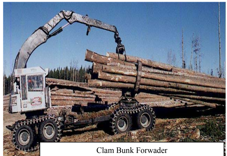
Clam Bunk Forwader