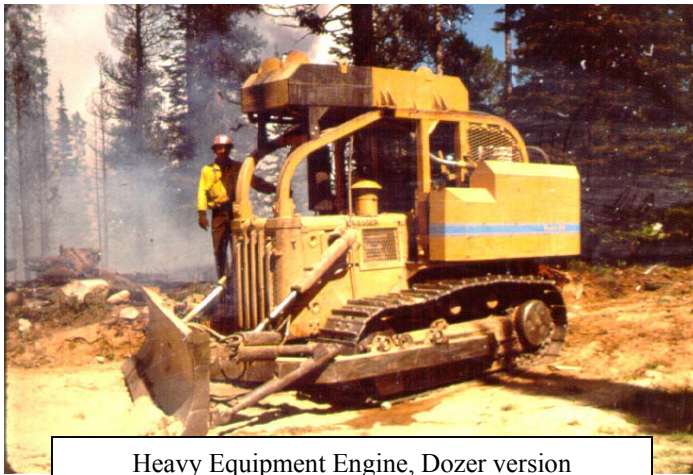
Heavy Equipment Engine, Dozer version