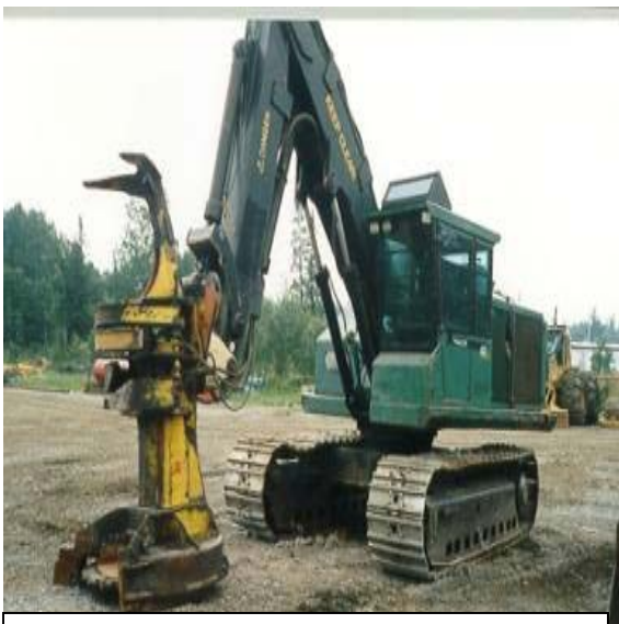
Self-Leveling Feller Buncher with hot saw