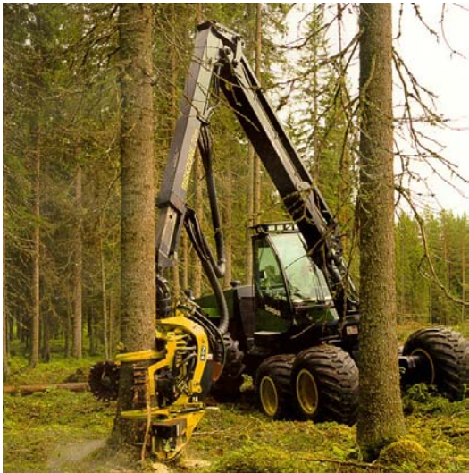
Rubber Tire Harvester