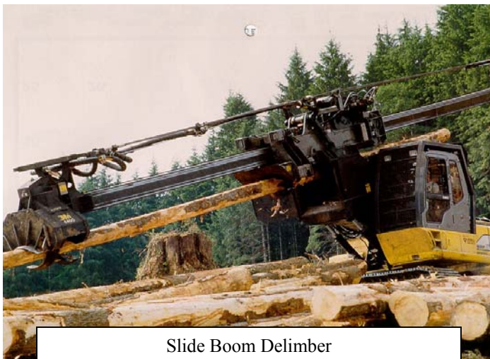
Slide Boom Delimber