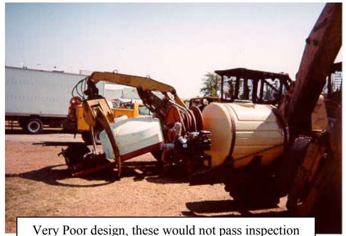
Very Poor design, these would not pass inspection