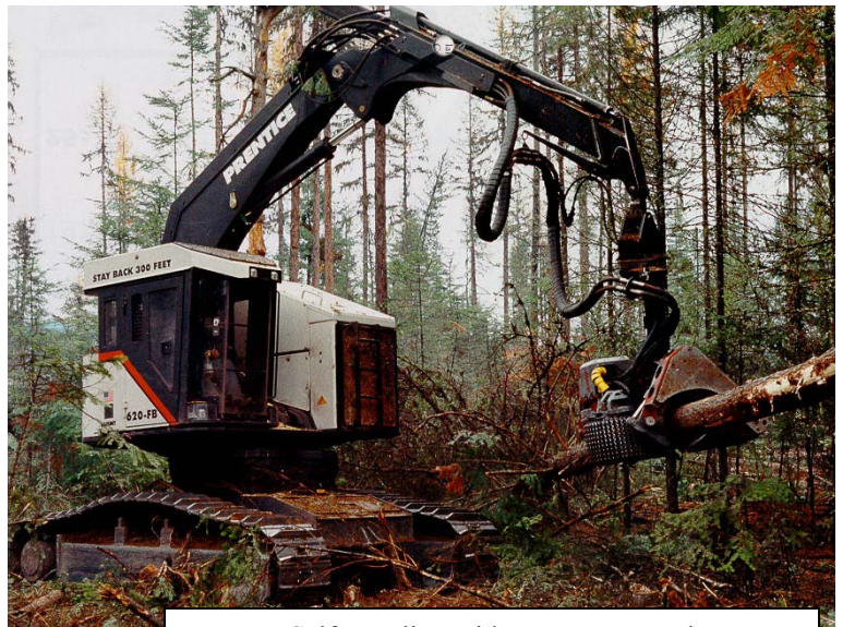
Self Leveling with Harvester Head