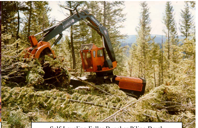
Self-Leveling Feller Buncher Piling Brush