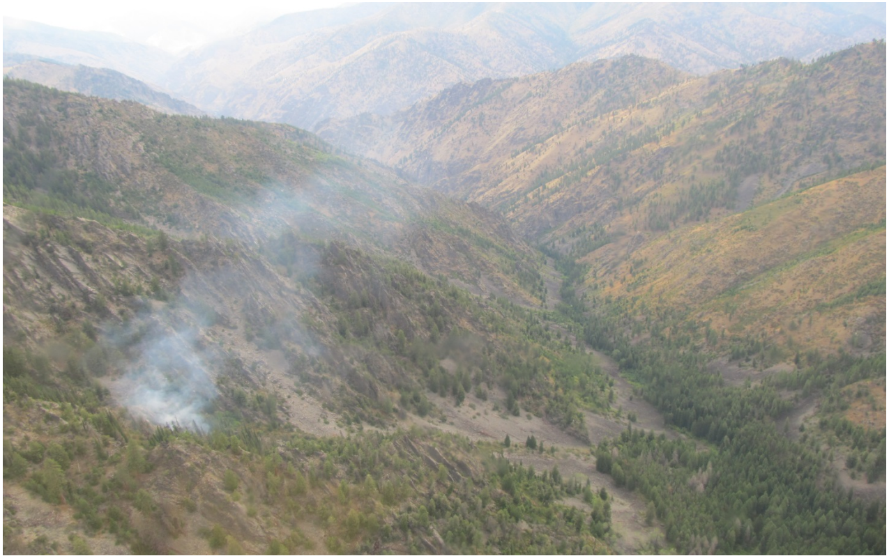
Goat Fire 2014

Interagency Federal fire policy requires that every area with burnable vegetation must have a Fire Management Plan (FMP). This FMP provides information about the fire management planning process for the Salmon/Challis National Forest and compiles guidance from existing sources such as but not limited to, the Salmon and Challis National Forest Land and Resource Management Plans, (Salmon: 1/1988, Challis: 6/1987) national policy, and national and regional directives.