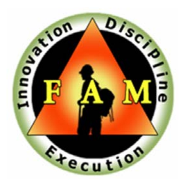
USDA Forest Service Fire and Aviation Management