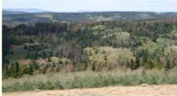
Beetle killed conifer encroachment in the Pole Creek Drainage